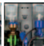
Fresh Brew Version